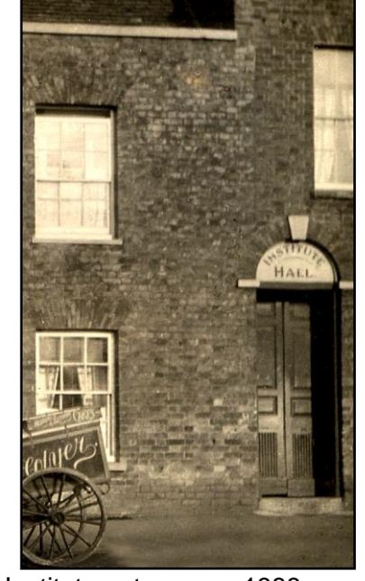
Institute entrance c. 1888